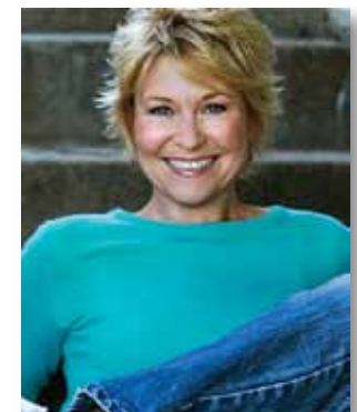
Dee Wallace www.iamdeewallace.com